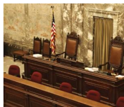
CRS Report for Congress: WTO Dispute Settlement: Status of U.S. Compliance in Pending Cases: May 2, 2007 - RL32014